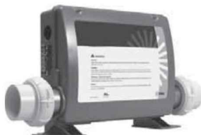
This document covers VS and GS systems 500Z through 521Z with Balboa Panels VL200 through VL406. www.balboa-instruments.com

Some systems use this one button to control two devices. The first button press will activate one device. Press again to have both devices active. Press again to turn off the first device only. Press one more time to turn both devices off.